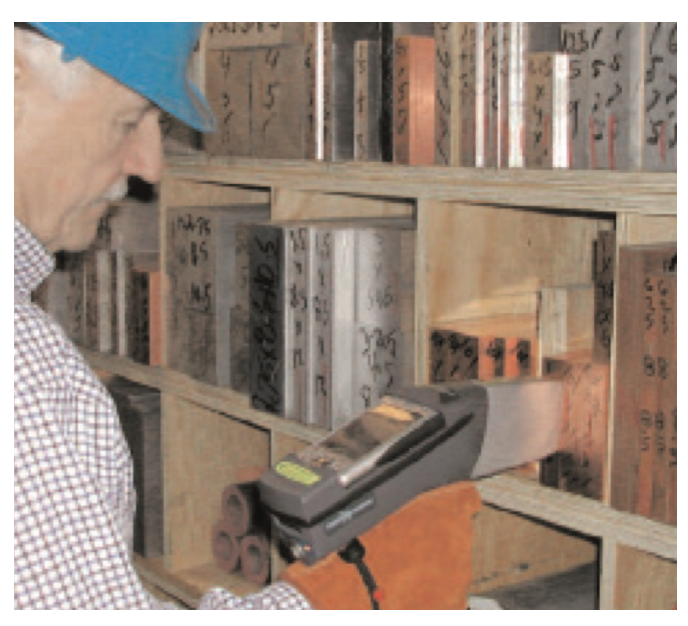
X-ray fluorescence (XRF)